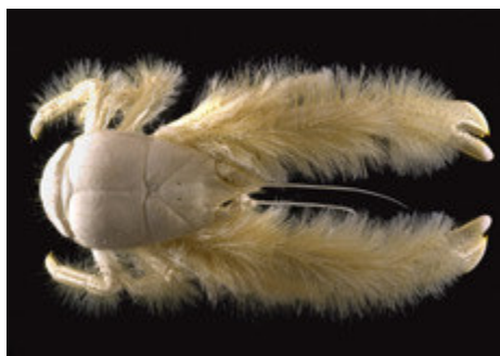
The blind crustacean, Kiwa hirsuta , is about 15 centimetres long.

Scientists have labelled it with its own genus and species, Kiwa hirsuta : "Kiwa" after the goddess of shellfish in native Polynesian culture and "hirsute" because it's hairy.